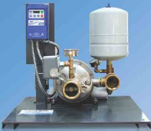
AM-30V, AM-50V, AM-60V